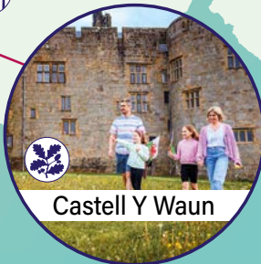
Castell Y Waun