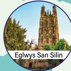
Eglwys San Silin